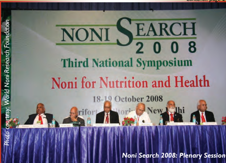
Noni Search 2008: Plenary Session