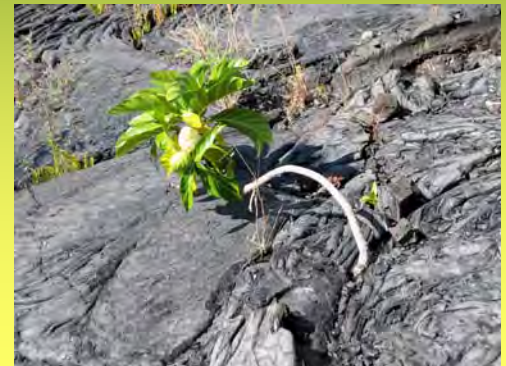
Noni growing on a dried lava bed in Hawaii

Ever since its introduction by early colonizers, noni has become naturalized on many Pacific islands. Today, it thrives in a wide range of soils and environments, including lava soil, forests, tide pools, gulches and cliffs, coastline and beaches, coral atolls, limestone beds and arid climates. It grows well in wet to moderately wet conditions from sea level up to 800 m elevation.