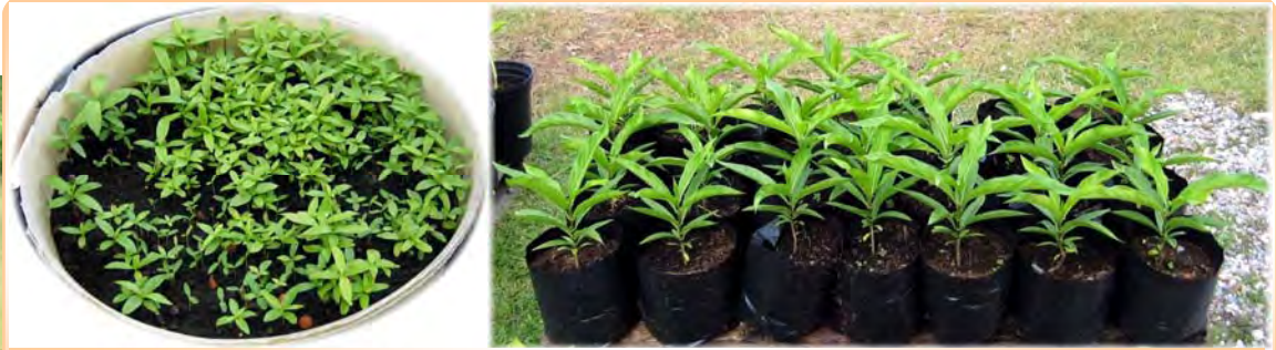
Scarification gives rapid and uniform seed germination (left); three months old noni seedlings grown in polybags, ready for transplant into the field (right)

“Formerly, when religion was strong and science weak, men mistook magic for medicine; now, when science is strong and religion weak, men mistake medicine for magic”