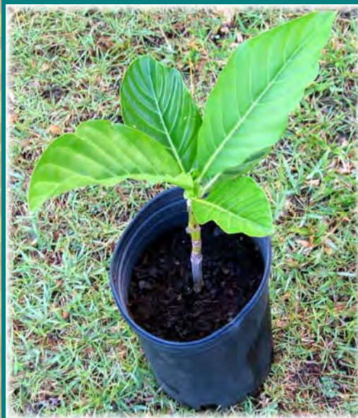
Noni plants established from stem cuttings (as above) are generally weak without tap root system

Vegetative propagation is a rapid way to produce a large population of plants that are same as mother plant. However, plants from