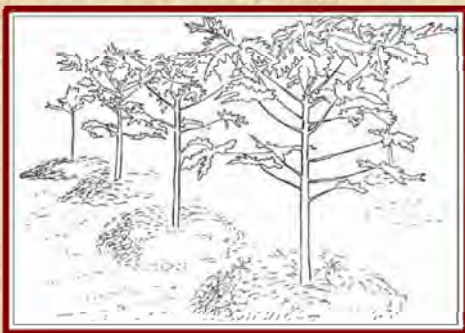
Gamwele Peoliu Ka Ye Ketabu Tag Wol Bwe Yete Iretag Lago