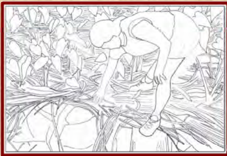
Sapei Peoliu La Ye Ketabu Tage Woal