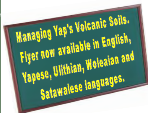
Volcanic red soils are the least fertile and most degraded soils in Yap