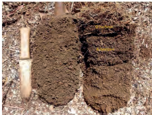
Figure 5. Degraded soil with (R) and without mulch (L)

The most important management strategy is to maintain existing topsoil through erosion control measures. Building depleted topsoil is accomplished through additions of organic matter either as compost or mulch. Mulch applied to the soil surface will become incorporated into the soil as it decomposes. Soil Organic Matter (SOM) is a source of nutrients and can be thought of as a slow-release fertilizer. If it is economically feasible, additions of lime are useful not only for raising the soil pH and lowering the aluminum content, but the calcium is also a needed plant nutrient. Raising the pH can also increase the negative charge on these variable charge soils and thereby increase the cation-exchange capacity.