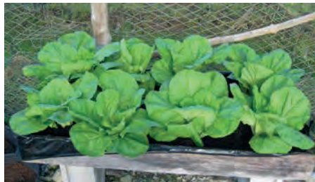
Figure 8. Vegetable grown in wooden trays

Micro-gardens assist the communities to reduce poverty and food insecurity by yielding fresh vegetables every day, thereby improving their food supply and nutrition. With proper training communities are able to scale up the operations that promote income generation through the sale of production surplus. Micro-gardens are highly productive and easily managed by the communities. Locally grown food decreases island communities' reliance on fossil fuels for transport of food from outside market that reduces society's carbon footprint.