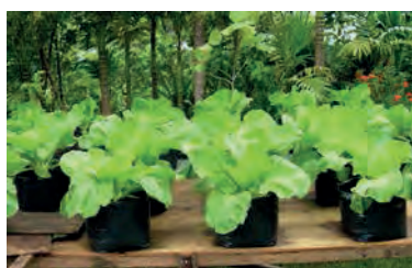
Figure 7. Vegetables grown in nursery polybags

Raised beds are freestanding garden beds constructed above the natural terrain and one of the proven methods for growing a variety of crops to bypass otherwise challenging soil conditions. Poor soil nutrient conditions detailed in the earlier section prevents successful growth of crops on volcanic red soils. Raised bed gardens improve growing conditions for plants by lifting their roots above poor soil (Fig. 6). Soil in the bed is amended with a mixture of compost, coir pith and composted chicken manure to provide a better medium for plants. A variety of traditional root crops and garden vegetables are successfully grown using this system. Raised bed gives greater control over soil quality and nutrition. Higher soil levels and improved soil quality offer better access, less maintenance and easier harvest for communities engaged in vegetable gardening. Dense planting techniques result in higher production per bed and help in controlling weeds. By utilizing harvested rainwater, communities usually manage the freshwater required for irrigation.