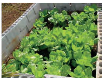
Figure 6. Vegetables on a raised compost bed

Climate-smart agriculture is a science-based approach to increasing smallholder productivity under challenging environmental conditions. Climate-smart agriculture seeks to increase sustainable productivity, strengthen farmers' resilience, reduce agriculture's greenhouse gas emissions and increase carbon sequestration (FAO 2010). In subsistence agriculture-based smallholder systems this innovative approach is not only important for food security but also for poverty reduction, as well as for aggregate growth and structural change. Production could be achieved through a number of crop systems which range from smallholder mixed cropping and livestock systems to intensive family farming practices. However, there is no blueprint for climate-smart agriculture and it is often specific to particular locations and production systems. Its precise nature varies from place to place, influenced by a whole host of local factors, including the climate, the soil, the crops grown, available technologies and the knowledge and skills of individual farmers. The approaches detailed below are some of these techniques that communities successfully adopted at the Gargey settlement.