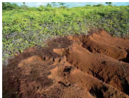
Figure 3. Degraded soil under ferns with no topsoil

The soils highlighted in this study are mostly degraded, dominated either by ferns or grasses (open savannah). While the origins of these savannahs are still debated (Falanruw 1993; Hunter-Anderson 1991), a more intensive form of agriculture was practiced there mainly in the more fertile areas. Topsoils hold the bulk of nutrients and have higher organic matter content (Fig. 4). Organic matter can complex with soluble aluminum and take it out of solution so that it does not interfere with plant functions. Aluminum becomes soluble when pH drops below 5.2. Plant species and varieties vary in their resistance to the effects of aluminum toxicity; some plants may show toxicity symptoms at 10 percent aluminum saturation whereas other species may tolerate more than 90 percent aluminum saturation. Many agricultural crops cannot tolerate more than 50 percent aluminum saturation, which occurs just below the topsoil in these