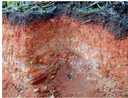
Figure 2. Forested volcanic soil with intact topsoil

Soils on Yap's volcanic landscapes developed in rocks that probably formed during the Miocene but the soils may have formed in the Pleistocene (Johnson et al. 1960). That timeframe allows ample time for deep rock weathering in Yap's humid tropical environment. However, because of heavy rainfall (110-130 inches per year) and warm climate, many of Yap's soils have been depleted of nutrients through leaching. Leaching of nutrients causes a residual buildup of iron and aluminum in many of the soils giving them a reddish color (when oxidized). These soils either sustain forests because of lack of severe topsoil disturbance (Fig. 2) or are degraded through topsoil removal and then support mostly ferns that are adapted to harsh soil conditions (Fig. 3).