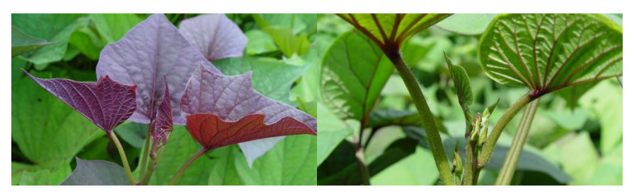
Figure 5 Close-up views of sweet potato plants in field