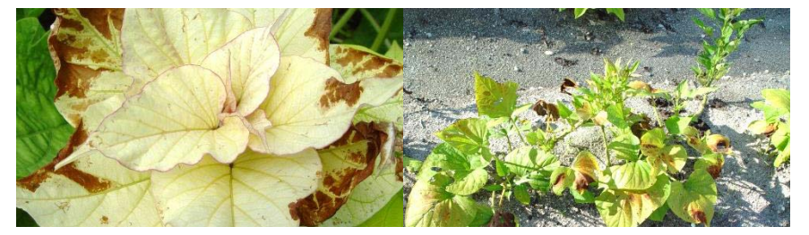
Figure 8 Iron deficiency in sweet potato, causing symptoms varying from yellow interveinal chlorosis to complete bleaching of leaf blades, and necrosis on leaf blades and tip (left); and symptoms of zinc deficiency in sweet potato showing chlorosis and reduction in size of young leaves, narrowing of the leaf blade and a greater tendency of the lateral lobes to point more acutely towards the leaf tip. Internodes are also shortened below the tip (right)