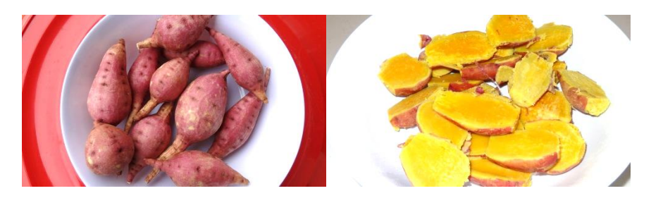
Figure 18 Storage root of sweet potato (SP-04); and cooked sweet potato storage root

Figure 17 Storage root of sweet potato (SP-05); and cooked sweet potato storage root