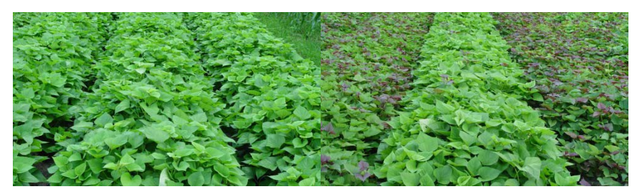
Figure 12 Five-week old sweet potato plants showing healthy growth