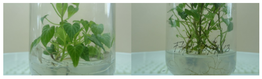
Figure 2 Tissue culture multiplication of sweet potato

To avoid disease transmission through roots and facilitate the availability of required number of plants, slips (transplants) should be used as planting material. These slips should be taken from hardened micropropagated plants that should be maintained in pots filled with mixture of fine sieved sand and compost in nursery cum greenhouse. Slips of 25-30 cm length with at least 5-6 leaves should be cut and planted immediately in a newly prepared field in case of local plantations. However, 1-2 days old slips that are packed carefully and kept moist could be used for outer island plantations.