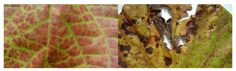
Figure 6 Symptoms of magnesium deficiency in sweet potato, showing purple-red-brown pigmentation of the upper surface of interveinal tissue (left); and typical symptoms of phosphorus deficiency are evident, including purpling and subsequent yellowing of older leaves in sweet potato and interveinal chlorotic zones developing to necrosis on an older leaf (right)

porous texture of island soils. Sweet potato requires only moderate amounts of nitrogen. Excessive nitrogen amounts may result in vigorous vine growth leading to cracked, misshapen roots of poor storage quality. To ensure good yield, second dose of compost (15 kg per 10 linear meter) and fertilizer 5-10-10 (nitrogen, phosphorus, and potassium; 400 gm per 10 linear meter) should be applied to both sides as side dressing with a distance of 15-20 cm from plants when plants attain an age of two weeks and fresh growth has begun.