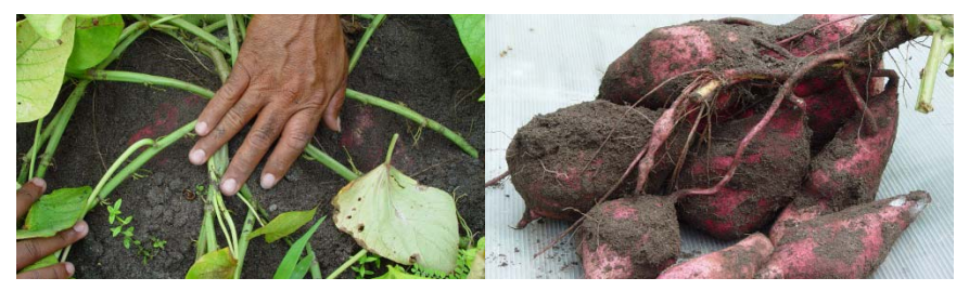
Figure 13 Sweet potato storage roots; and Sweet potato storage roots, harvested from a single plant