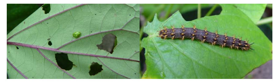
Figure 9 Sweet potato green tortoise beetle, Metriona circumdata (Hbst.) feeds on the leaves, making large round/irregular holes and eventually skeletonizing the leaves (left); and close-up of sweet potato blue moon butterfly caterpillar Hypolimnas bolina (Linn.) (right)