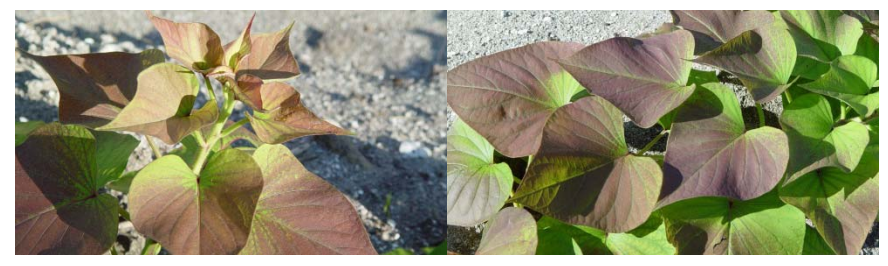
Figure 7 Symptoms of magnesium deficiency, five-weeks-old sweet potato, showing purple-brown pigmentation of the upper surface of interveinal tissue. Pigmentation occurs initially near the leaf margin and later spreads over all interveinal zones

Figure 6 Symptoms of magnesium deficiency in sweet potato, showing purple-red-brown pigmentation of the upper surface of interveinal tissue (left); and typical symptoms of phosphorus deficiency are evident, including purpling and subsequent yellowing of older leaves in sweet potato and interveinal chlorotic zones developing to necrosis on an older leaf (right)