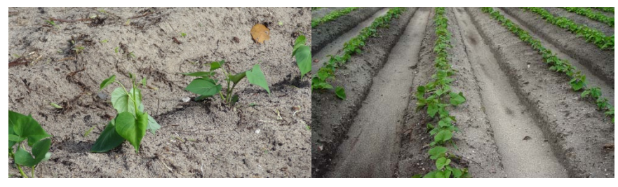
Figure 4 Sweet potatoes planting on beds

Plants should be set 30 cm apart in the row with one third of the basal portion covered with the soil. The plants should be watered immediately to establish good soil-to-root contact. A starter solution (1-2 tablespoons of low-analysis fertilizer such as 12-12-12 nitrogen, phosphorus, and potassium per 4 liter of water) could be used to water the plants.