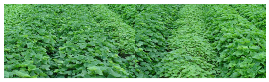
Figure 11 Five-week old sweet potato plants showing healthy growth

picked up simultaneously as they are dug.