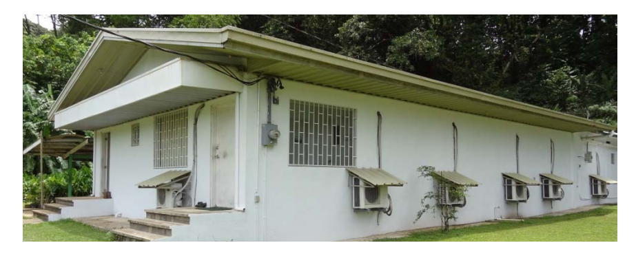
Figure 1 Kosrae Agricultural Experiment Station